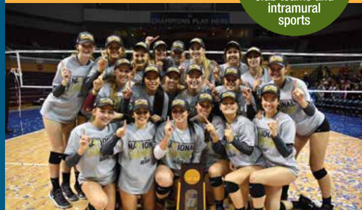
Athena volleyball team won the 2017 NCAA Division III championship, the first NCAA women's title in CMS program history.

Approximately 20 club teams and intramural sports