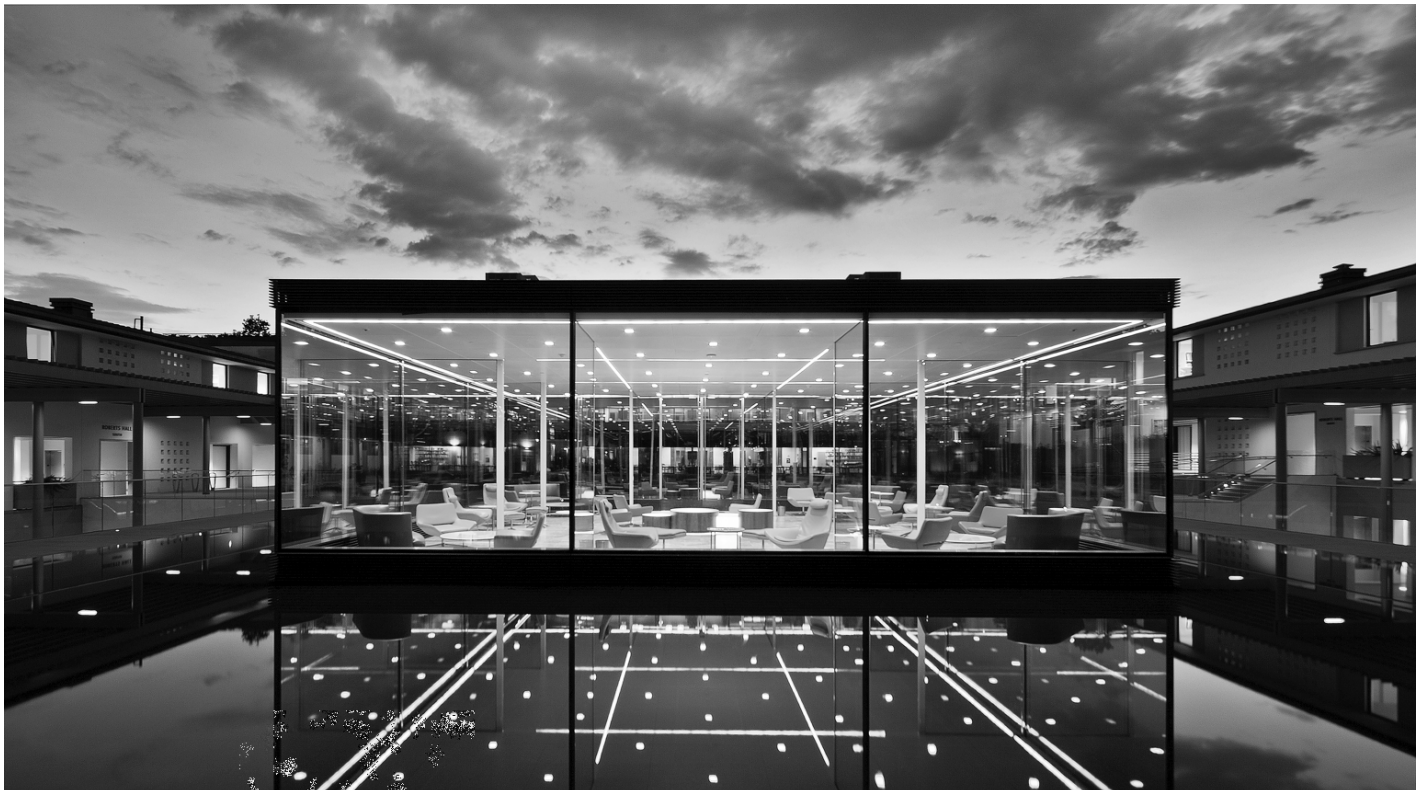
The Kravis Center Living Room

CMC continues to monitor trends related to residence hall fire incidents and alarms to provide a fire safe living environment for all students. New programs, policies, and systems are developed as needed to help insure the safety of all students, faculty and staff.